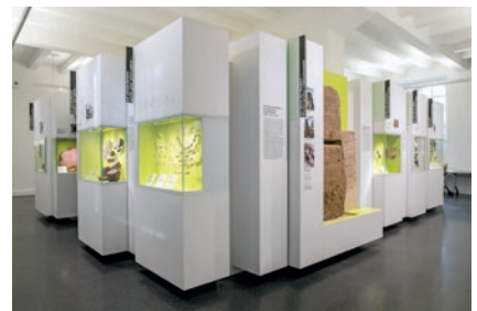
Hessian State Museum, Kassel