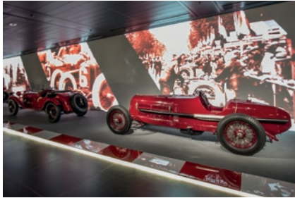
Alfa Romeo Museum, Arese

Quality consciousness, on-time completion, and the efficient use of materials are standard procedure with NUSSLI. Our own production facilities for carpentry, timber, and metal construction have proven a huge advantage in this respect. They are helpful to us in planning the construction of test structures and developing special solutions, as well as ensuring quality-conscious implementation.