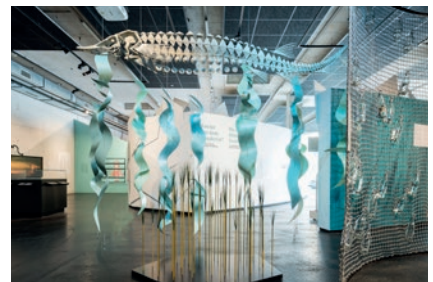
Tropenhaus Frutigen (Tropical Greenhouse)