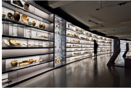
State Museum of Archaeology, Chemnitz