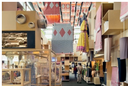
Kuwait exhibit, Expo Milano