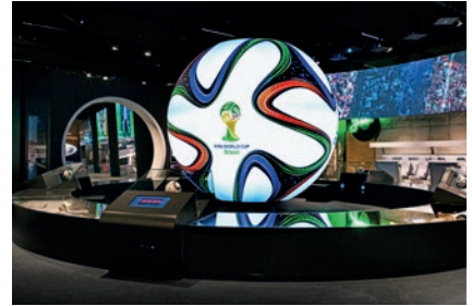
German Football Museum, Dortmund