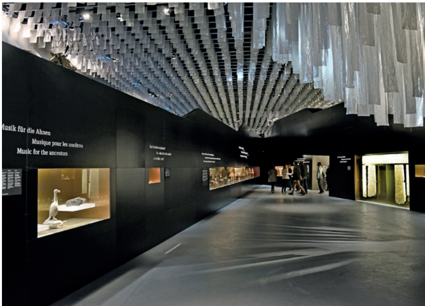
Qin Exhibition, Bern Historical Museum