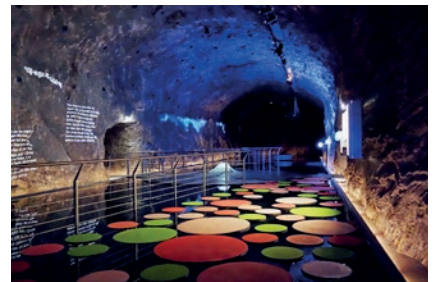
Sasso San Gottardo themed exhibition, Gotthard