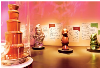
Chocolat Frey Visitor Center, Buchs